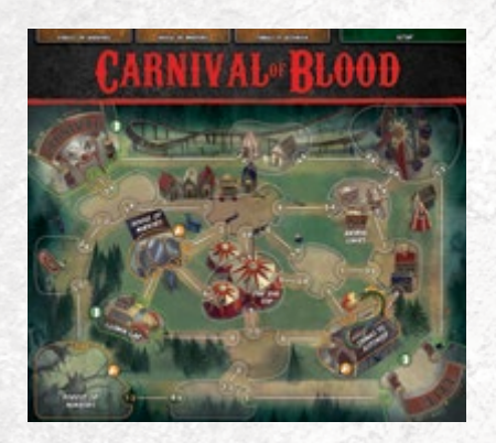
1 Location board