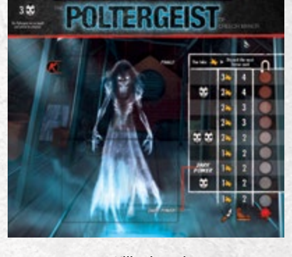
1 Killer board