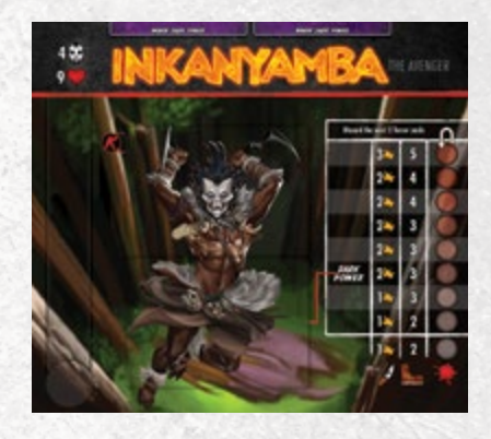
1 Killer board