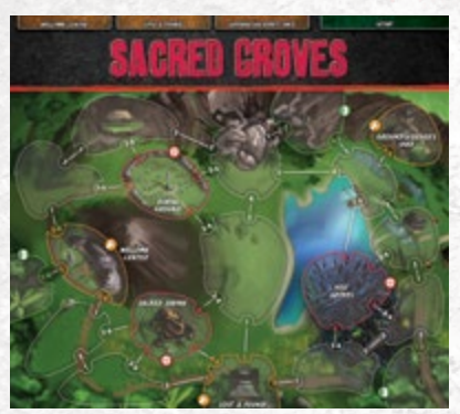
11 ocation board