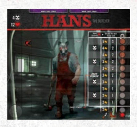
1 Killer board