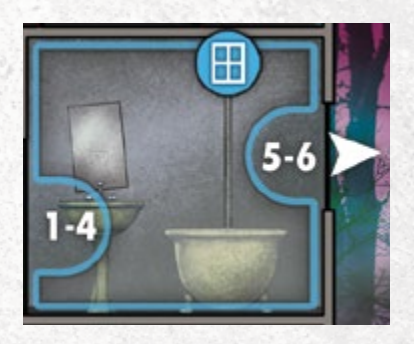
Example of one-way space